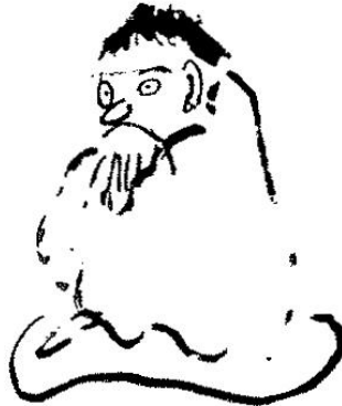
Tesshu Yamaoka Self-Portrait